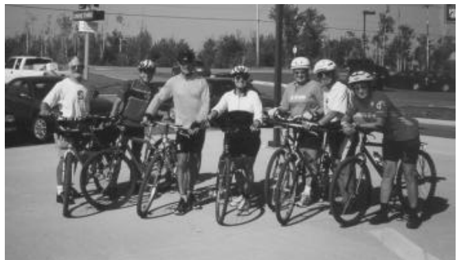
Cataraqui Trail End-To-End, 2000