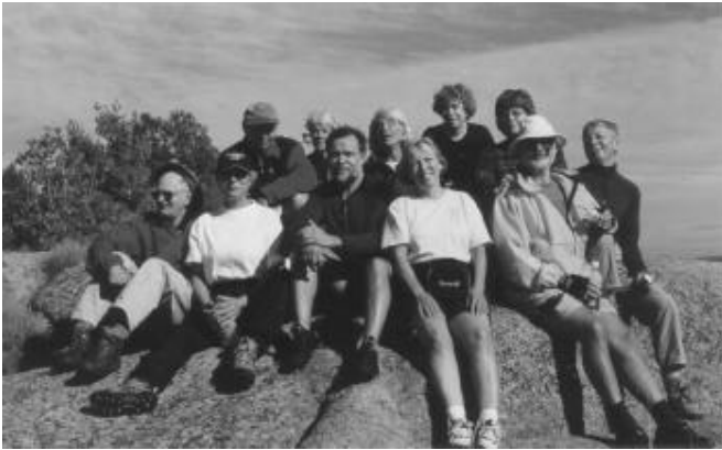
Rock Dunder Hike, 2000