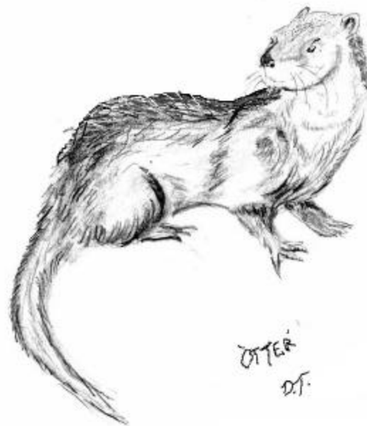
Debbie Twiddy, 1999

SEPT. 29, Sat. DOG PADDLE ON DOG LAKE. Luxury paddle through scenic lakes touched with fall colour, to enjoy ice cream at Melody Lodge, followed by the option to dine at Loughborough Inn. MC is David Forkes: 634-5840.