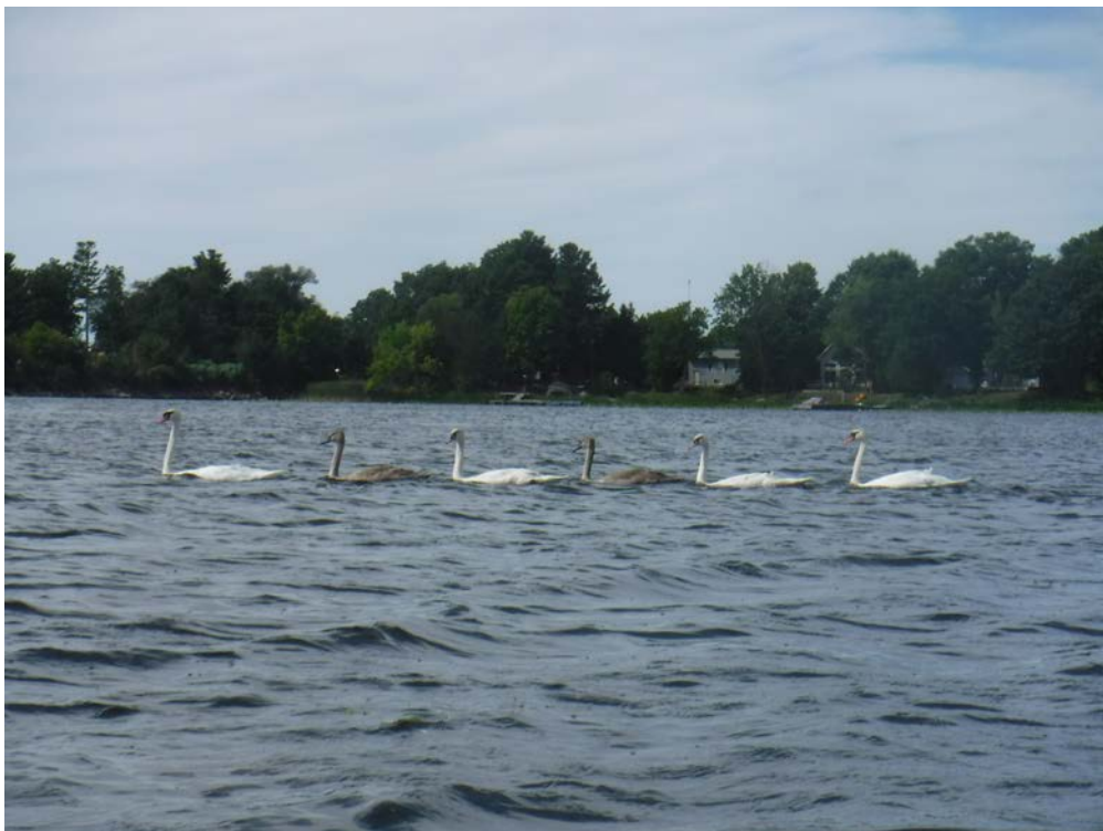
Not quite seven swans a'swimming, but close enough.