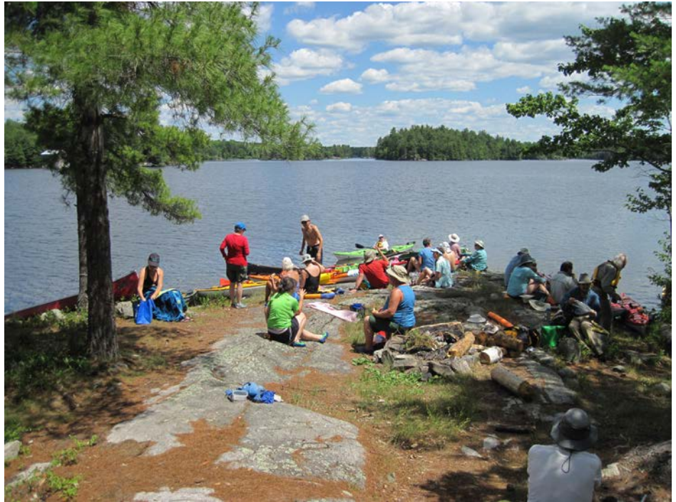
Lunch & swim on Mellon Lake, July 2018.

Generally an easy paddle, however wind and wave action can occasionally be challenging. Modifications are possible. Call Steve at 613-542-1054 for detail.