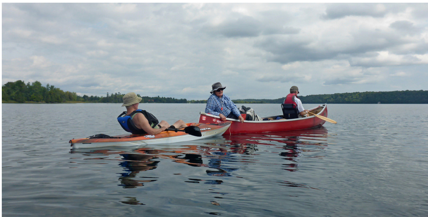
Laid back on Loughborough Lake.