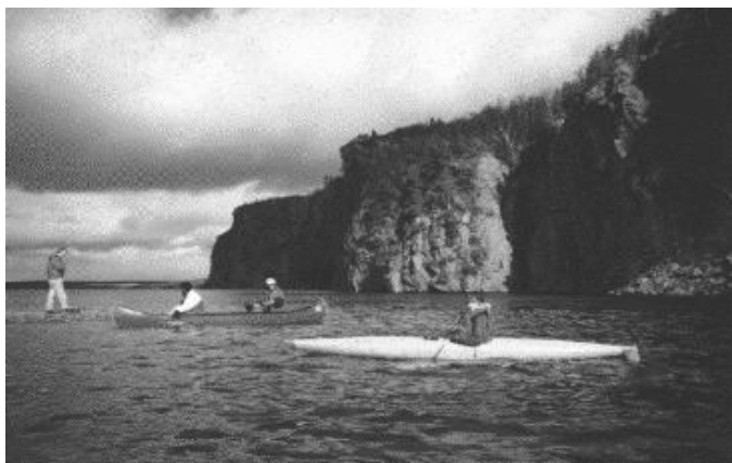
Canoe and Kayak Outing