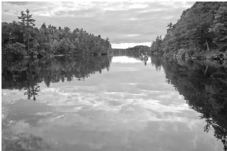
Paddling Rock Dunder Shoreline

have had to reduce the number of properties they operate, and the Rock Dunder camp location was declared surplus and put up for sale in September of 2004.