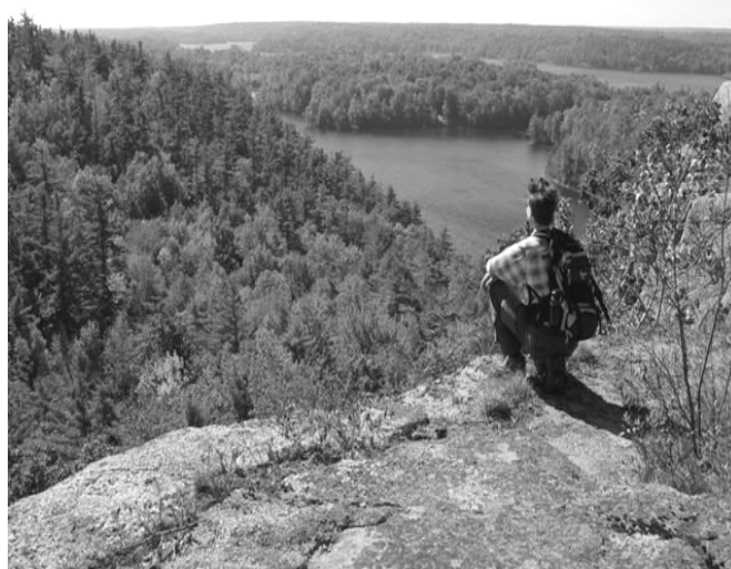
Rock Dunder Viewpoint

A key element of their plan is fund-raising from the community and individuals, and the RWLT is hoping to find motivated donors amongst the membership of the Cataraqui Canoe Club. I think we do have a real connection with Rock Dunder, and appreciate the importance of securing this special place, not only for our time, but as a legacy for future generations.