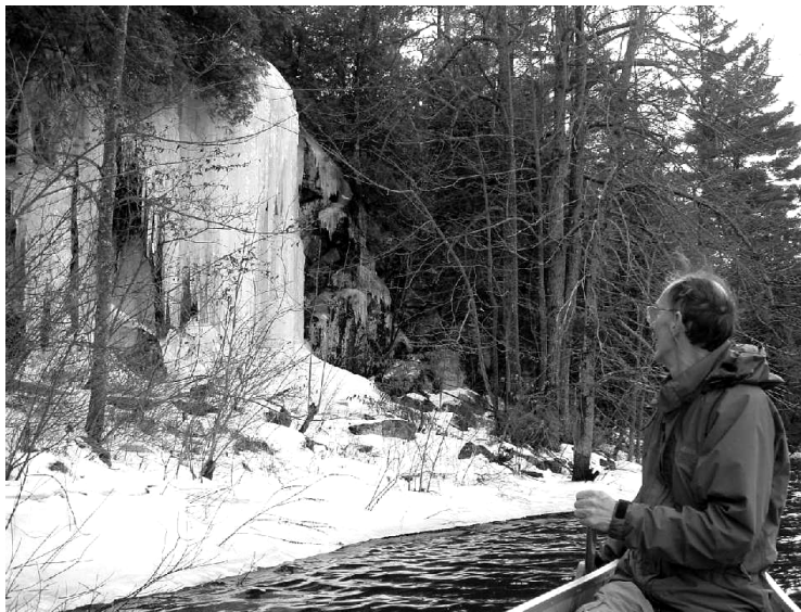
Gananoque River in January

Breast Cancer Action, Kingston's Chestmates Dragon Boat Team would like to give a huge thank you to the Cataraqi Canoe Club for support on the water, allow