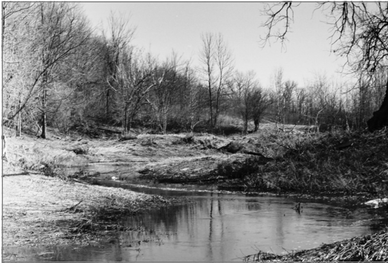
Collins Creek in the Springtime

Hope to see all of you at the Open House.