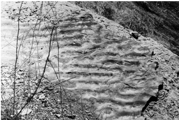
Wave Pattern on Limestone

Fossil clam shell markings, trails of worm activity and wave patterns embedded in the thin, calcium carbonate, limestone layers, formerly the silt or mud bottom of the Ordovician Sea tells of another age 460 million years ago, a sea covered landscape, now fossilized for today's viewing.