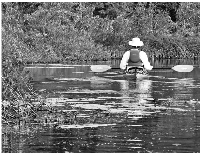
Lower Rock Lake's water is clean and clear.