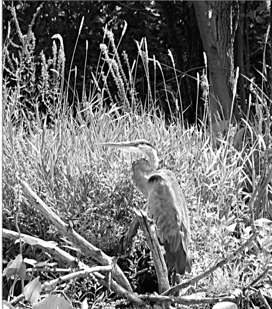
The Great Blue Heron on a Lyndhurst Lake to Singleton Lake paddle

A sure indication that spring is here is when the ice between rapids melts and our favourite waterways become navigable again. With whitewater canoeing becoming increasingly popular with beginners, the