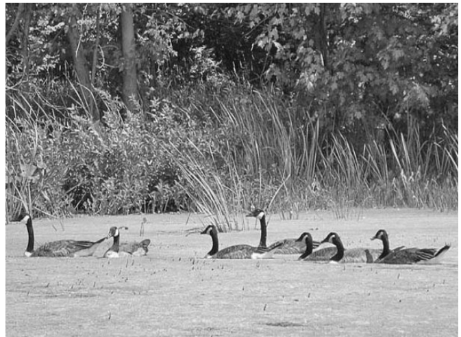
A mother with her goslings.