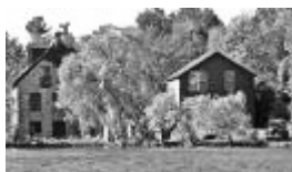
Early Morning light at Bedford Mills.

dues; casual volunteers (instructors, Boathouse Duty staff, trip leaders) could be provided with a temporary punch code number that would be changed regularly.