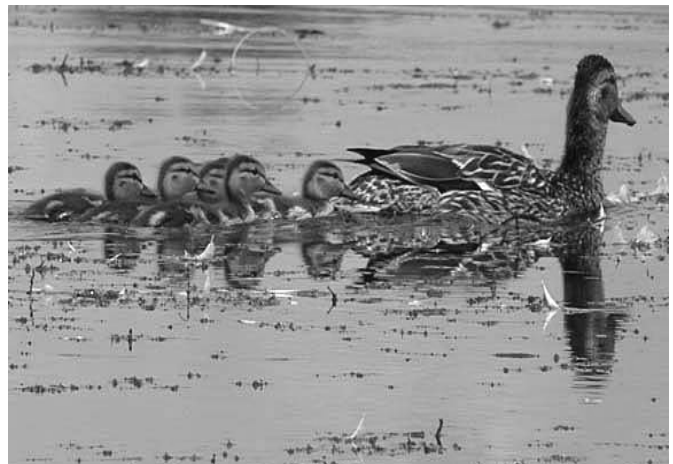
On a very windy day we ended up in a cove next to the boathouse at the foot of Cataraqui Street and saw these little ducklings with their mother, and other ducklings resting on lily pads.