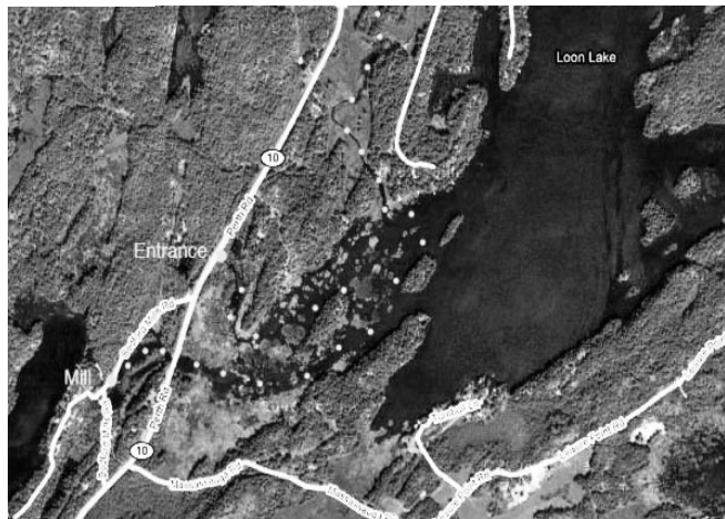
A paddle at Bedford Mills & Loon Lake.