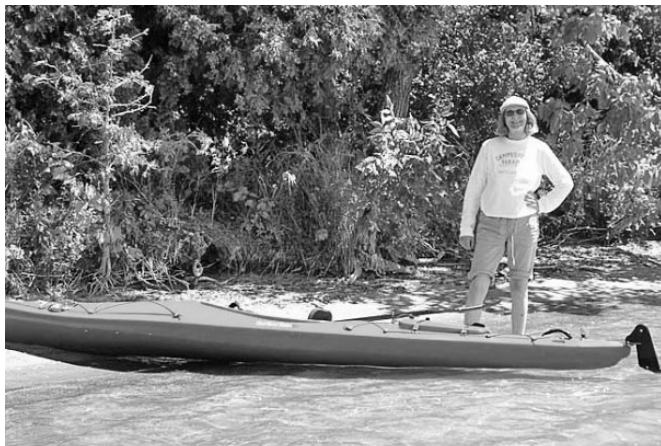
The beach was tiny, sandy, shallow, clean, and the water was warm. A fantastic little beach on Loughborough Lake.