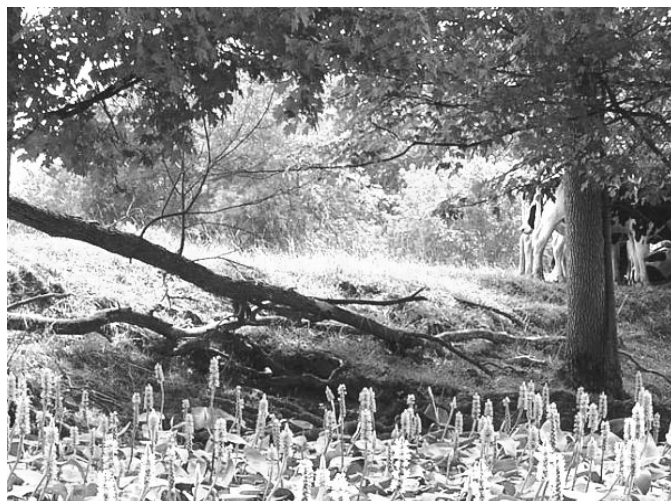
The stream area out of Lyndhurst Lake is quite rural as opposed to wild which is where we normally paddle. It is an old settlement with farms along the river. Notice the cows on the right.

email: Info@trailheadkingston.ca www.trailheadkingston.ca