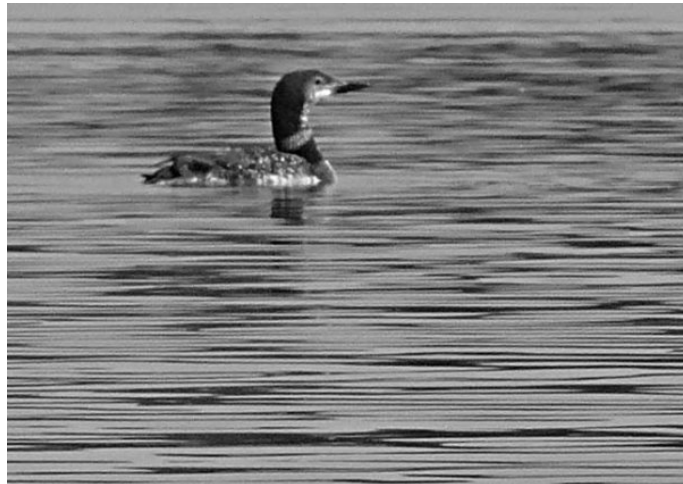
A juvenile loon on Loughborough Lake without its final coat.

The Cataraqui Canoe Club of Kingston now spans three centuries and recreational paddling continues to flourish. A fleet of club owned canoes and kayaks are in high demand to paddle from the boathouse (see page 3), and are available for use on numerous scheduled trips. Members can 'learn to canoe and kayak' with paddling sessions offered at beginner and intermediate levels (see page 3 of this issue for current, scheduled activities). Once local rivers and lakes are frozen, CCC members hike, skate, ski and party until spring thaw renews dreams of whitewater and paddling!