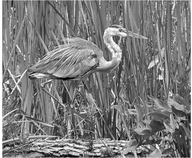
This Great Blue is enjoying her log.