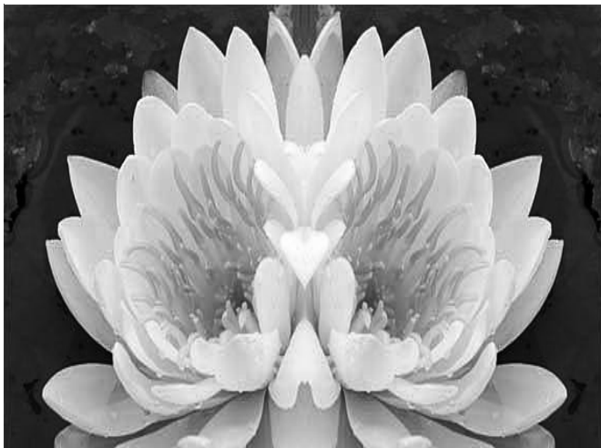
Found an Eyelash Lily in the lily pond.