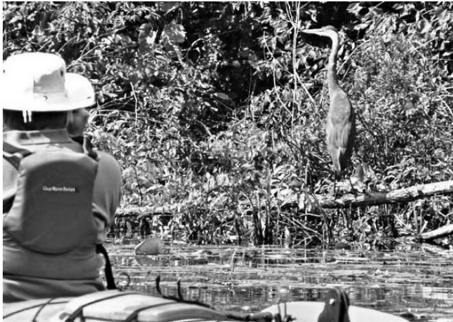
Travelled down Morton Creek toward Morton. To put in we took #15 to just before the Morton bridge, turned right on Briar Hill Rd, left on Fortune Line Rd, and left on Old Briar Hill Rd. At the sharp curve there is a putin spot. We saw a number of Great Blue Herons and Kingfishers.