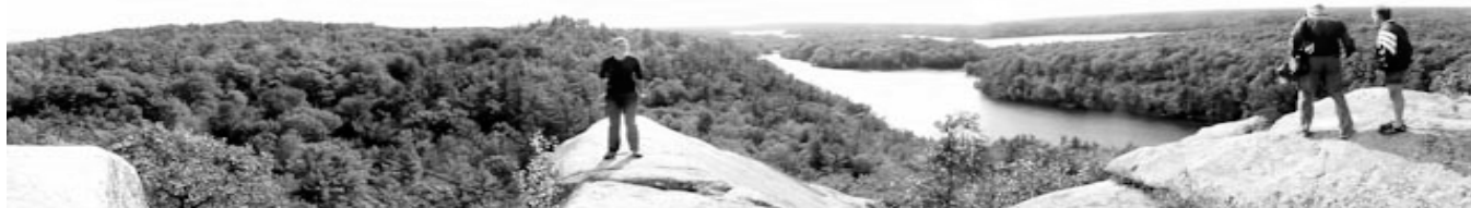
Bedford Mills to Morton Paddle and Hike, Pictures on left and above, taken from the top of Rock Dundar, and on the right at the bottom of Rock Dundar.