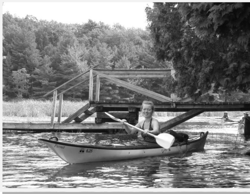
An August Paddle from Otter Lake to Kingsford Dam

Try to drop in at the boathouse during our Open House , Tuesday to Thursday, May 3 - 6, 6 - 8 p.m.