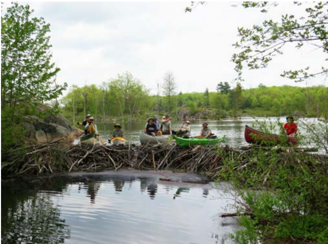
Beaver Dam on the Claire River