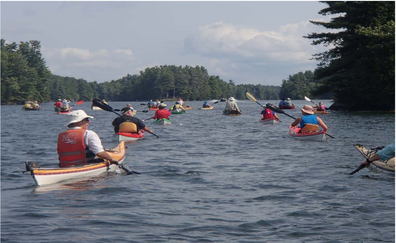
The CCC fleet on the move down Loughborough Lake toward a very enjoyable day.

I have been informed that a visiting paddler chained a red kayak to the docks over