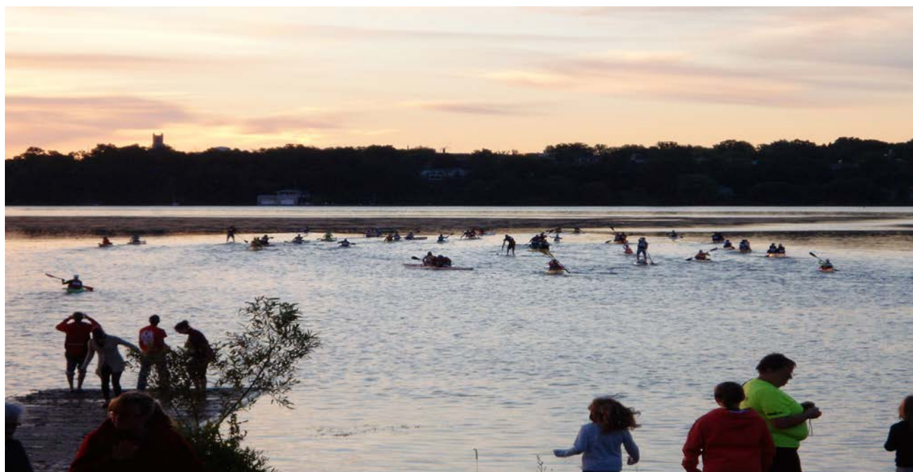
Kingston Inner Harbour, in front of CCC boathouse, K2O race start – Sat. 08 August at 6:05 am

As tiring as the race was for me, paddling only 55 km, I can scarcely imagine how difficult and tiring it must have been for indi-