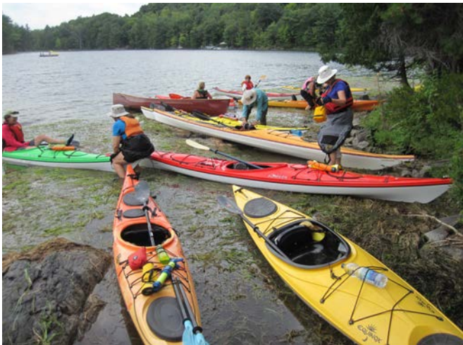
North end, Loughborough Lake, Picnic on Snake Island [St. Manders]