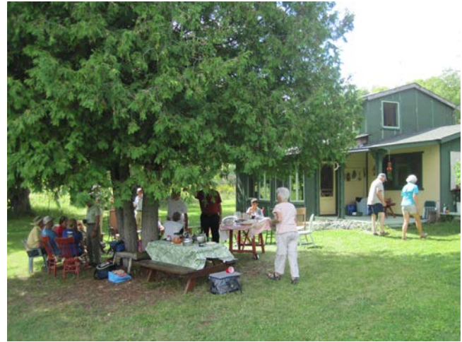
Benson Lake, Potluck at Janice's