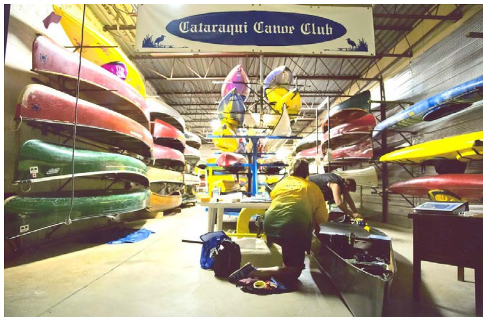
Cataraqi Canoe Club boathouse interior

About three years ago, a member of the Board suggested that we establish a presence on Facebook. None of the other board members present had any experience with Facebook and no interest in it.