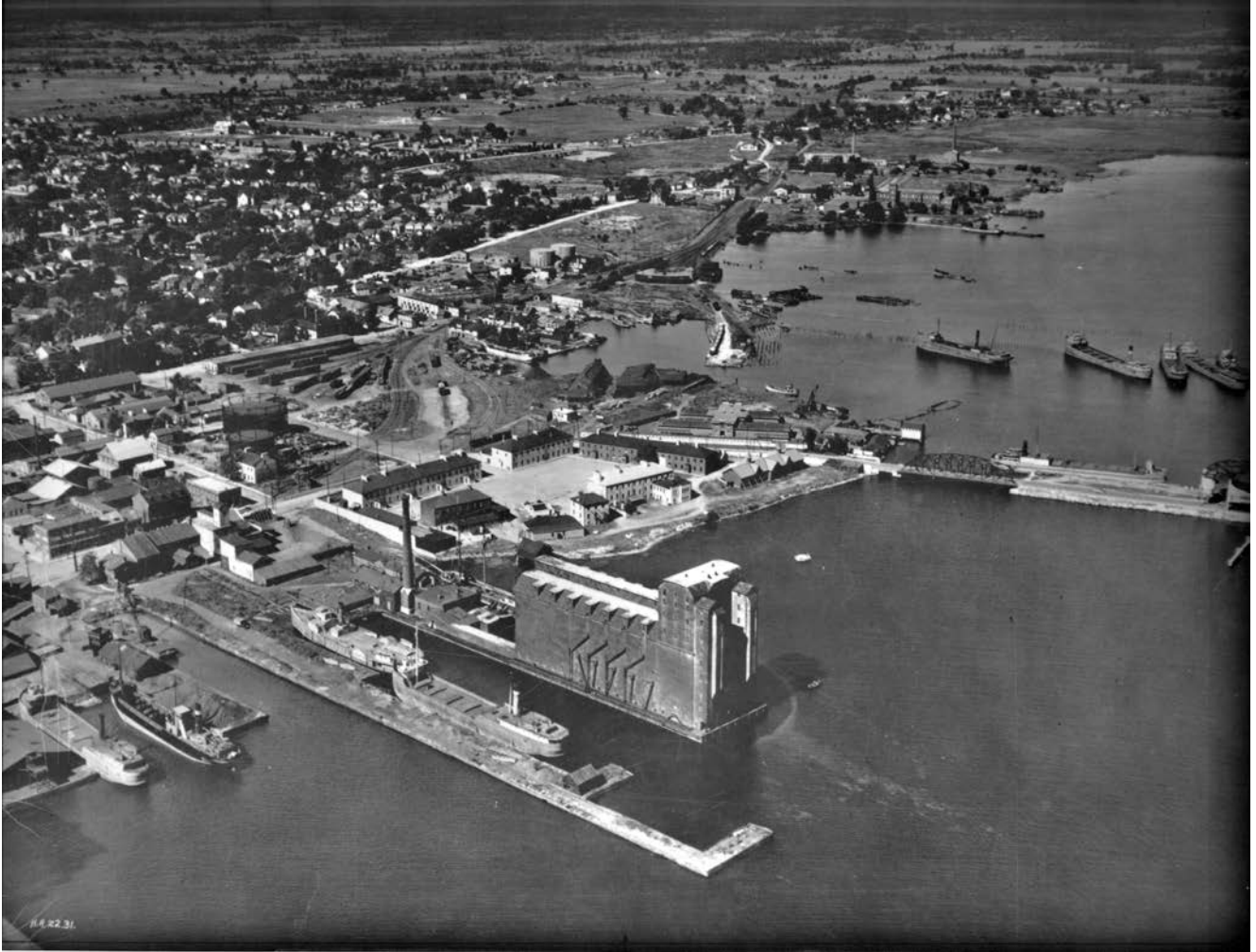
Kingston, Inner Harbour, about 1925