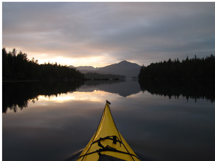
Haida Gwaii.