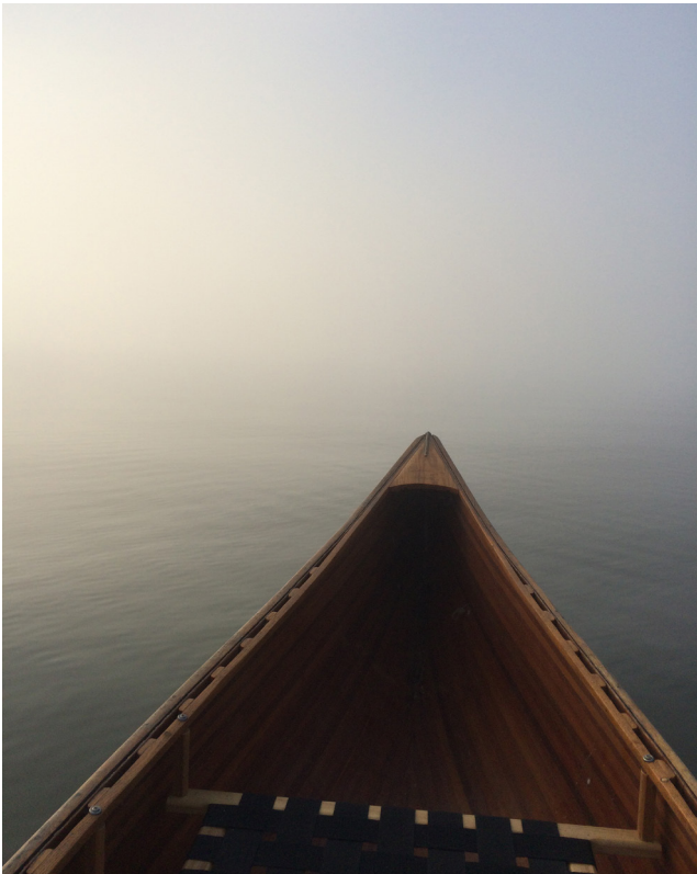
Leaving the Clubhouse on a misty morning.

We will follow a shoreline in hopes of sighting rare cottagers in their natural habitat, performing activities in accordance with spring rituals. Paddle would be approximately 12 km, or longer for some. This would warrant a revival stop at the "CreekSide" post paddle. Call Dave at 613-376-6883.