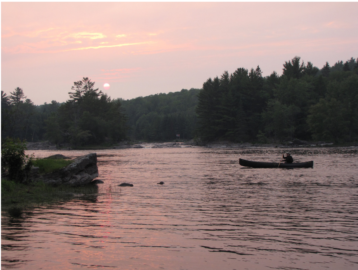
Palmer Rapids, Madwaska River.