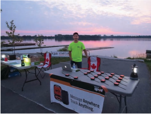
K2O racers rise with the dawn!

Paddling Race takes participants from Cataraqui Canoe Club to Rideau Club in Ottawa